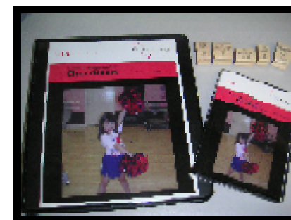
CheerBears Lesson Plan Package #206/$219.95