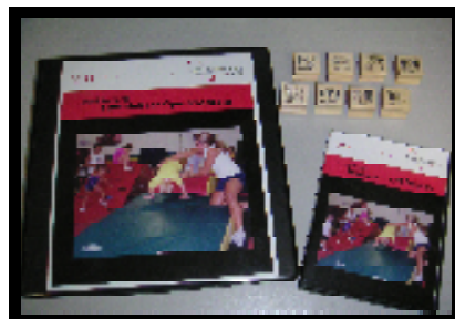
Tumblebear Gym Preschool Lesson Plan Package # 201/$219.95

Scroll Down for Additional Information On Each Product