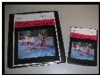
Complete Swim Lesson Program Lesson Plan Package #207/$499.95