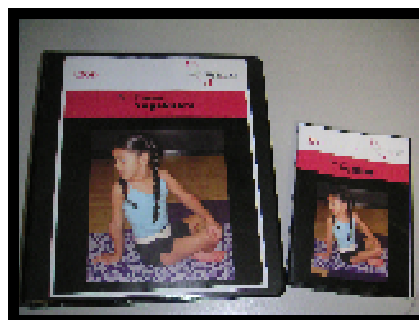
YogaBears Lesson Plan Package #209/$149.95