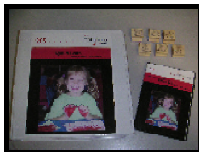
Gym-N-Learn Educational Preschool Lesson Plan Package #205/$219.95