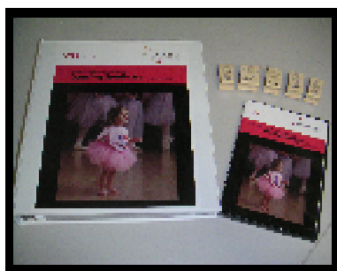
Dancing GymBears Preschool Dance Lesson Plan Package #203/$219.95